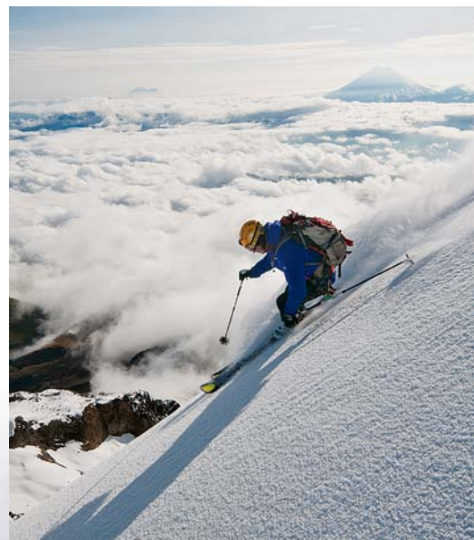
Giulia Monego gives it her all, from Ecuador's highest volcanoes to its lowest income bracket.